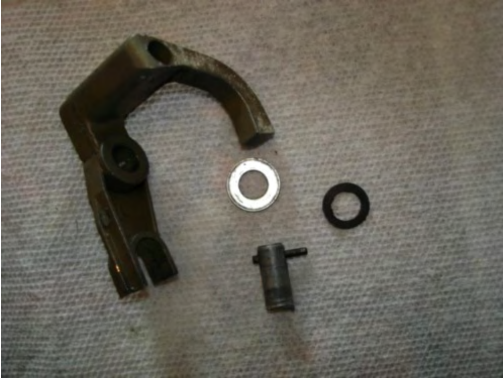
So here's the L shaped striker, the two washers and what's left of the metal pivot.