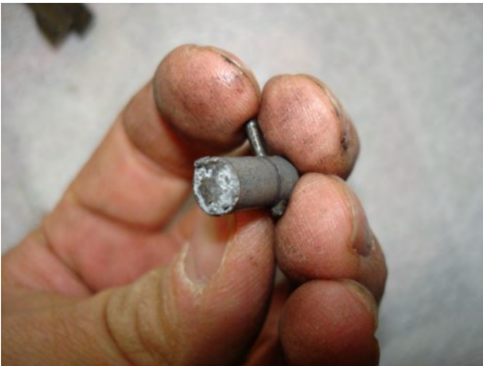
Not exactly the best casting metal used by VW.